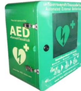
Dust & Waterproof Metal AED Cabinet Key Locked

Code: E-CAB-NJ-IMAVS Material: Sturdy metal Size: 38 x 36 x 20 cm Alarm: 120 dB Strobe light: Yes Power source: AA (LR6) Batteries Key Locked: No (Free access) Video screen: 10 x 11 cm Video playing: SD card Colors: Green or white