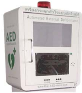
Indoor Metal AED Cabinet Alarm Video Sound

Code: E-CAB-NJ-IMAFA Material: Sturdy metal Size: 38 x 36 x 20 cm Alarm: 120 dB Strobe light: Yes Power source: AA (LR6) Batteries Key Locked: No (Free Access) Colors: Green or white