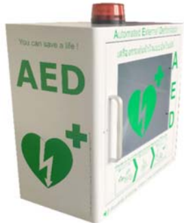
Indoor Metal AED Cabinet Alarm Free Access

This AED cabinet is wall mountable. Made from sturdy metal construction, it protects and prominently displays your AED. Free access. Alarm and strobe light. Available in green or white colour. Made in Europe.